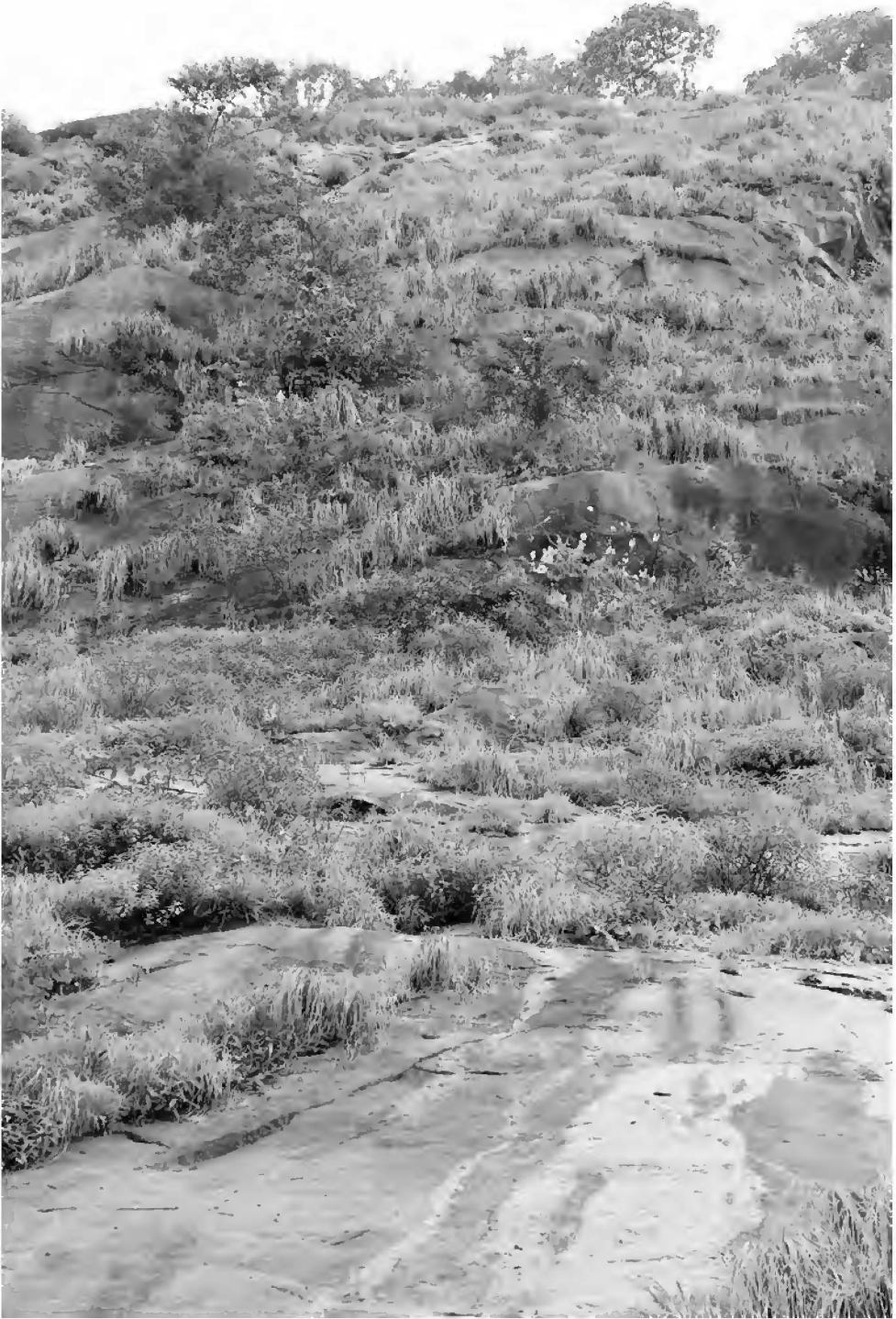
FIG. 2. Steep granitic cliffs at Malabar Wildlife Sanctuary, Kakkayam, Kozhikode, the natural habitat of Tripogon malabarica Thoiba & Pradeep. 21 Aug 2014.